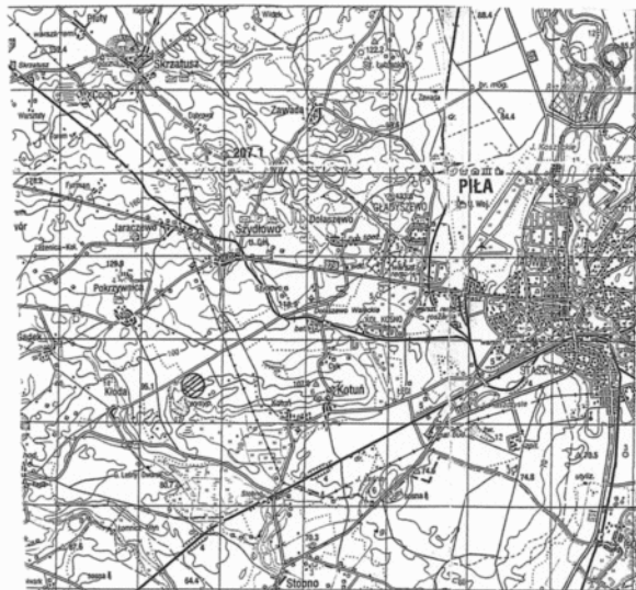
Lokalizacja Skala 1 : 100 000